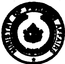
MOHAMED BOLKIAH MINISTER OF FOREIGN AFFAIRS BRUNEI DARUSSALAM

IN WITNESS WHEREOF this Instrument of Ratification is signed by the Minister of Foreign Affairs of Brunei Darussalam on this 2 nd day of .....June..... 2003.