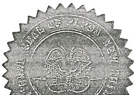
Hon. ANO PALA CMG MP Minister for Foreign Affairs and Immigration

Dated this 26 th day of March Two Thousand and Twelve.